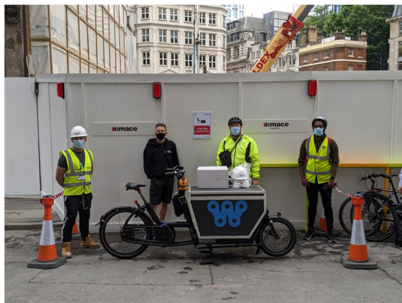
Top left: Pedal Me rider with freight delivery