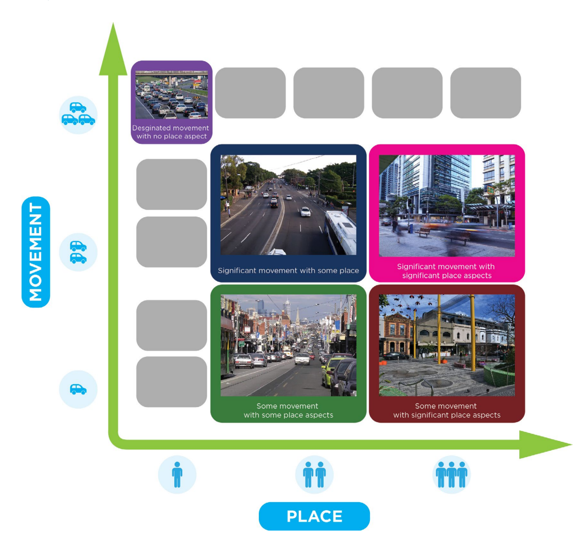
Figure 2 - Example of the Movement and Place matrix. Modified from the Government of South Australia's 'Streets for people' report, as documented in Wooley et al <sup>8</sup>.

Movement and Place methodology ('Link and Place' in the UK) recognises that these elements are different for any given road transport environment, and guides road and urban planning to achieve the best functionality for a given space. A common form of visualisation is a Movement and Place Matrix, which places roads and road types between the 'movement' and 'place' dimensions (Fig. 2). The 'movement' and 'place' axes may also be viewed as a proxy for the ratio between motor vehicles and VRUs. For example, higher levels on the 'movement' axis is approximates a higher motor vehicle to VRU ratio, and vice versa for the 'place' axis.