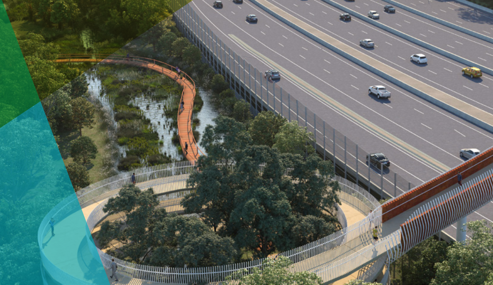
New bridge across the Eastern Freeway and boardwalk, linking to Koonung Creek walking and cycling paths. Artist impression only. Subject to change.