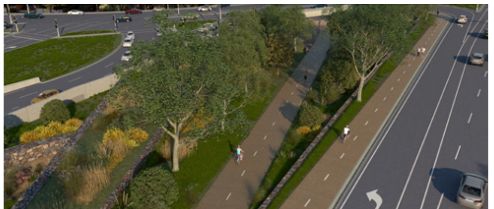
Grade separated crossing of Lower Plenty Road. Artist impression only. Subject to change.