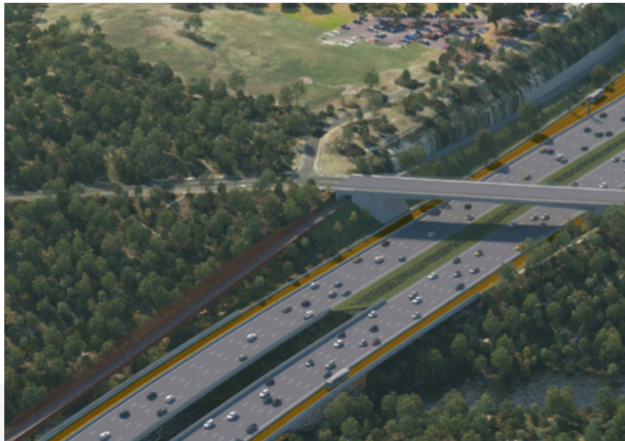
Aerial view of eastern bike corridor at Yarra Boulevard, Kew Artist impression only. Subject to change.