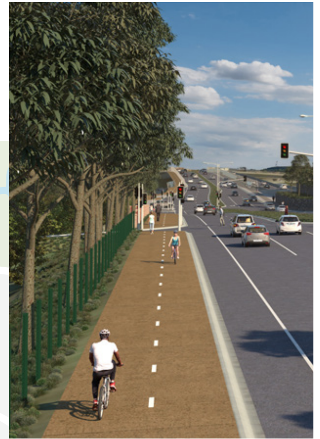
New walking and cycling paths at Bulleen Road Artist impression only. Subject to change.