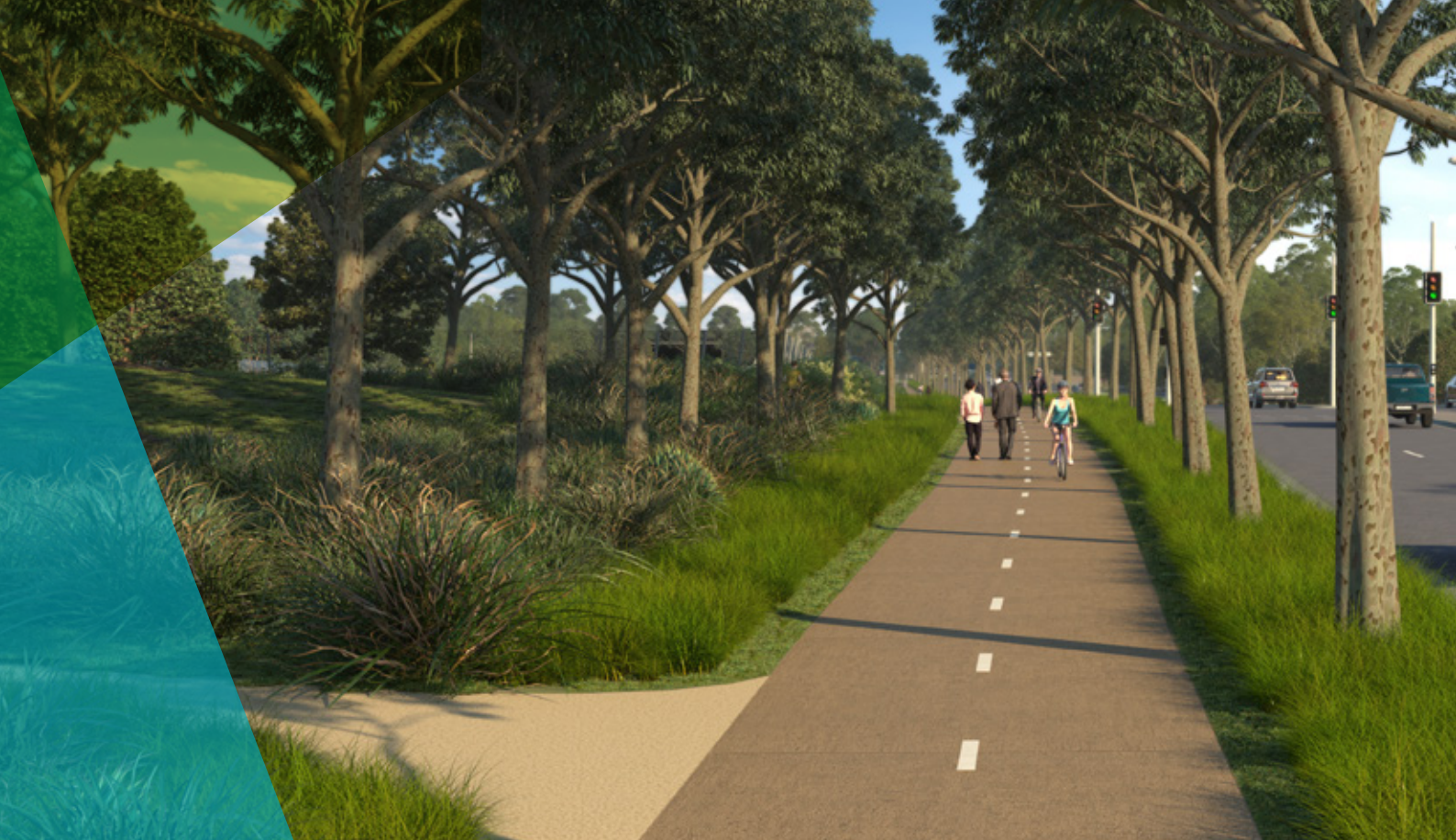
Greensborough Road walking and cycling paths. Artist impression only. Subject to change.