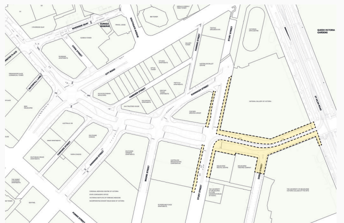
Stage 1 A - Early works construction zone between St Kilda Road and Sturt Street.

Pedestrians will continue to have access to the precinct.