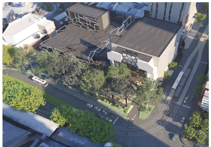
Artists impression of the new tram stop and Arts Gateway public open space.

Civil, road and landscape construction works between Sturt Street and City Road