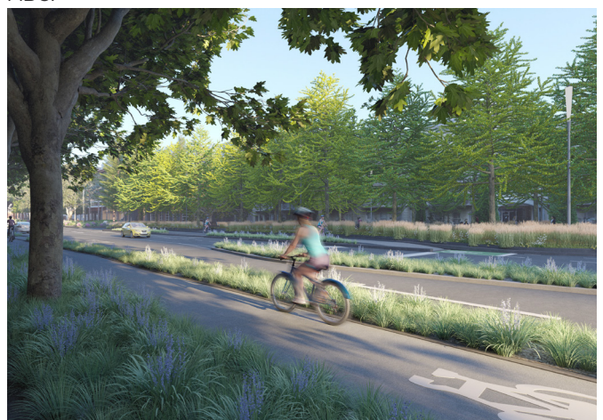
Artists impression of the new separated cycle lanes