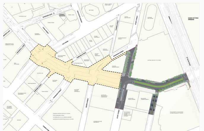
Stage 1 C - Construction zone for civil works between Sturt Street and City Road.

Southbank Boulevard will progressively be re-opened.