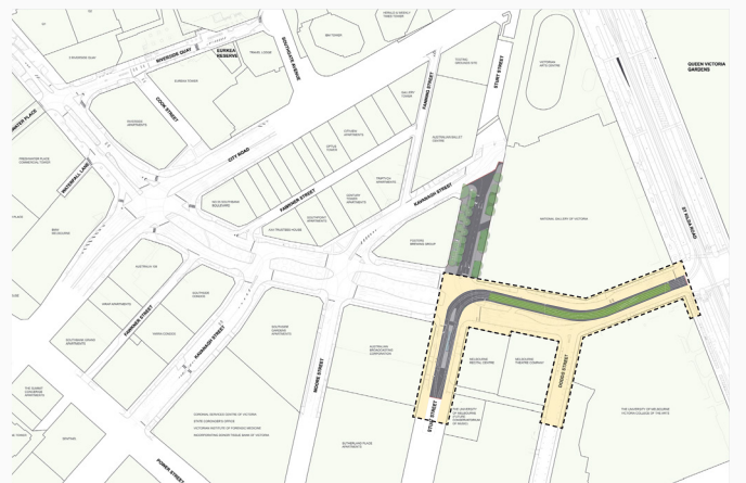
Stage 1 B - Construction zone for tram infrastructure extending from St Kilda Road south along Sturt Street.

Pedestrians will continue to have access to the precinct.