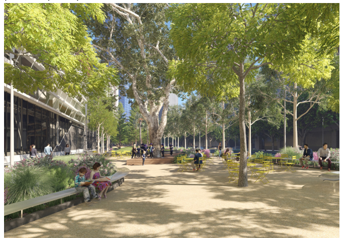
Artists impression of the public open space in front of the ABC.