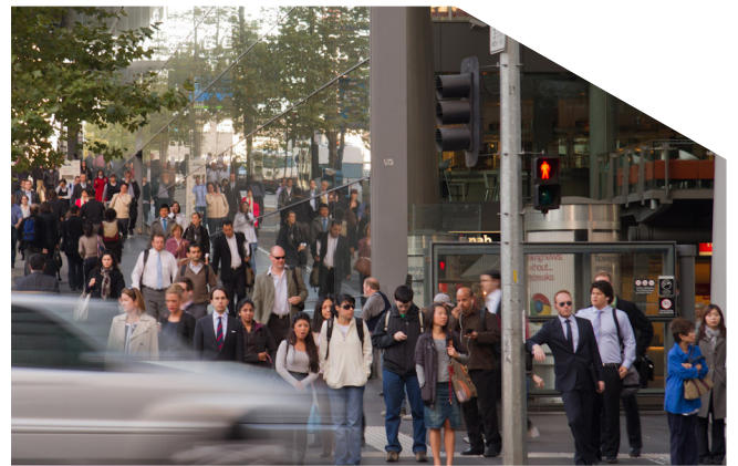
Vehicle priority increases wait times and pedestrian crowding

Current transport emissions in the City of Melbourne exceed the levels required to meet Australia's obligations under the Paris Climate Agreement. Private cars account for around 52 per cent of land transport emissions in the municipality. Electric cars have the potential to reduce emissions if they are powered by renewables. Victoria's coal fired power means that the CO 2 emissions of today's electric cars are no cleaner than conventional cars.