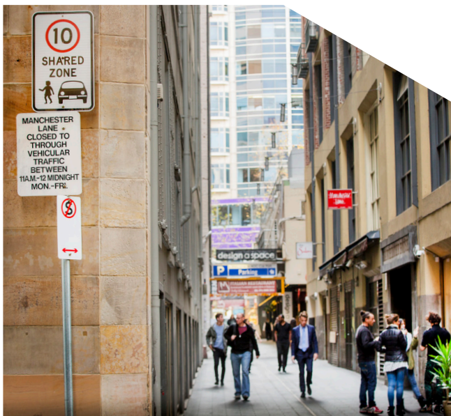
Shared spaces such as Manchester Lane serve people and vehicles

In Sydney's George Street, sections have been closed to cars to improve the public realm and walking environment, with more space for people and trees. A new light rail line has replaced a large number of diesel buses with a smaller number of trams.