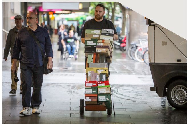
Hand trolleys are used to complete a delivery