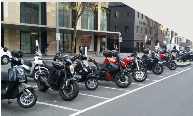
Motorbikes are allocated on-street parking on Russell Street