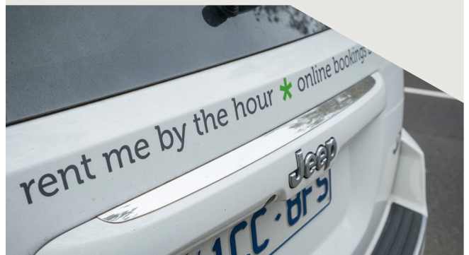
On-street car share spaces are allocated by the City of Melbourne