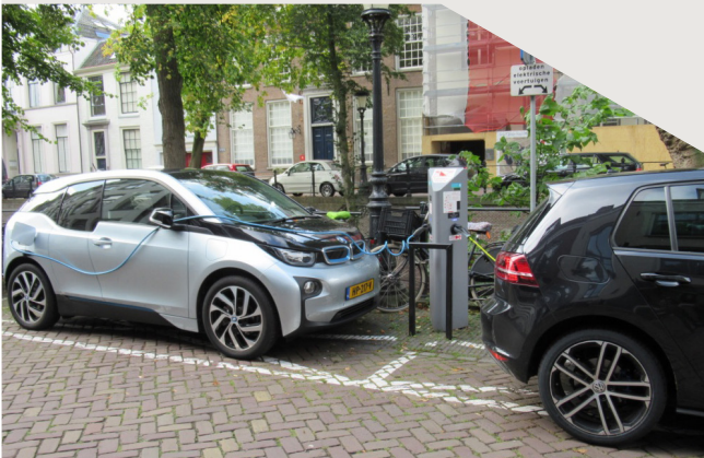
A car is stored on the street in Amsterdam while charging