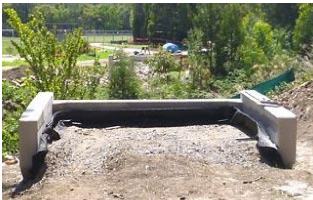
Looking north from Napier Waller Reserve