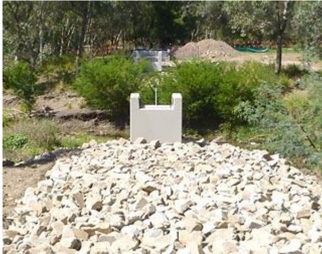
Looking from Sparks Reserve

Today the first two bridge decks are due to be lowered into place. We will post photos as they come to hand. You can see the progress in the images shown.