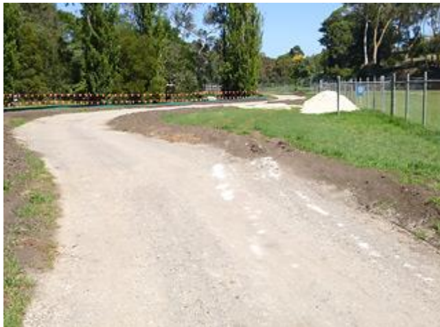
Path underway adjacent to Alphington Grammar Sports Fields