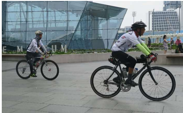
Some of whom pootle to the pub.