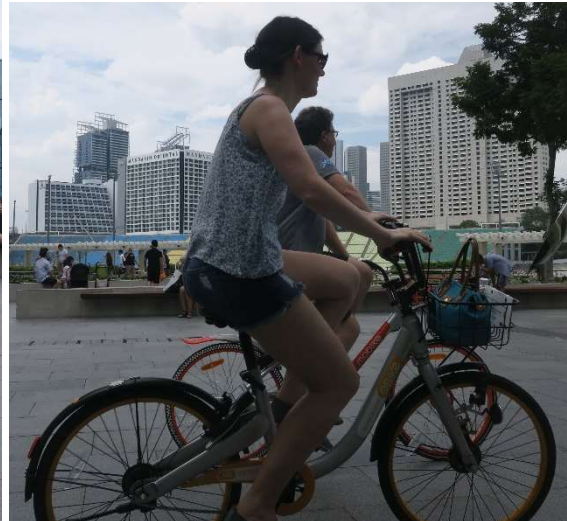
And they have lots of cyclists too.