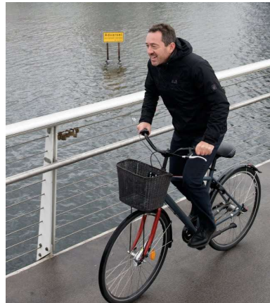
CHRIS BOARDMAN Cycling tour of Copenhagen