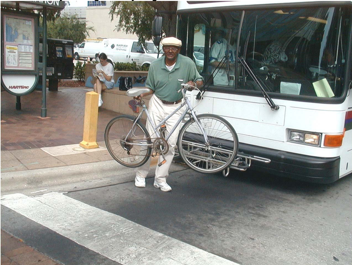
Figure 1: Bicycle racks mounted on the front of buses have provided an innovative way to integrate bicycling and transit.