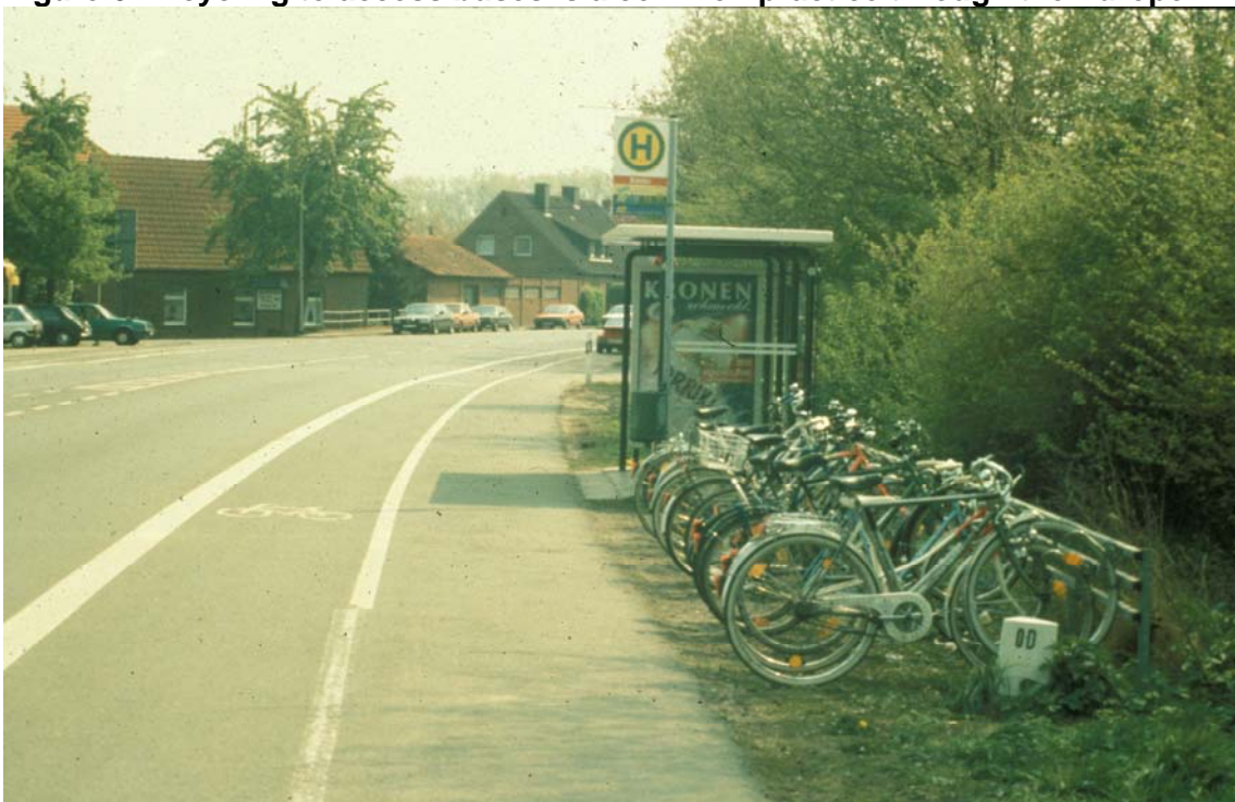
Figure 6: Bicycling to access buses is a common practice through the Europe