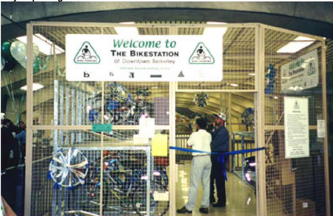
Figure 5: The Bikestation® of Downtown Berkeley, California provides valet bicycle parking for the local BART rail station.

One way to mitigate rack capacity limitations is to promote the Bike-to-Bus (BTB) strategy common in European nations that encourage patrons to bicycle to their bus stop, and leave their bicycle parked at the bus stop or transfer center. Perhaps the most important investment that transit agencies can make to implement this strategy is to provide more bicycle parking (bicycle parking racks and/or bicycle lockers) and incorporate bicycle racks into standard bus stop and transfer center designs.