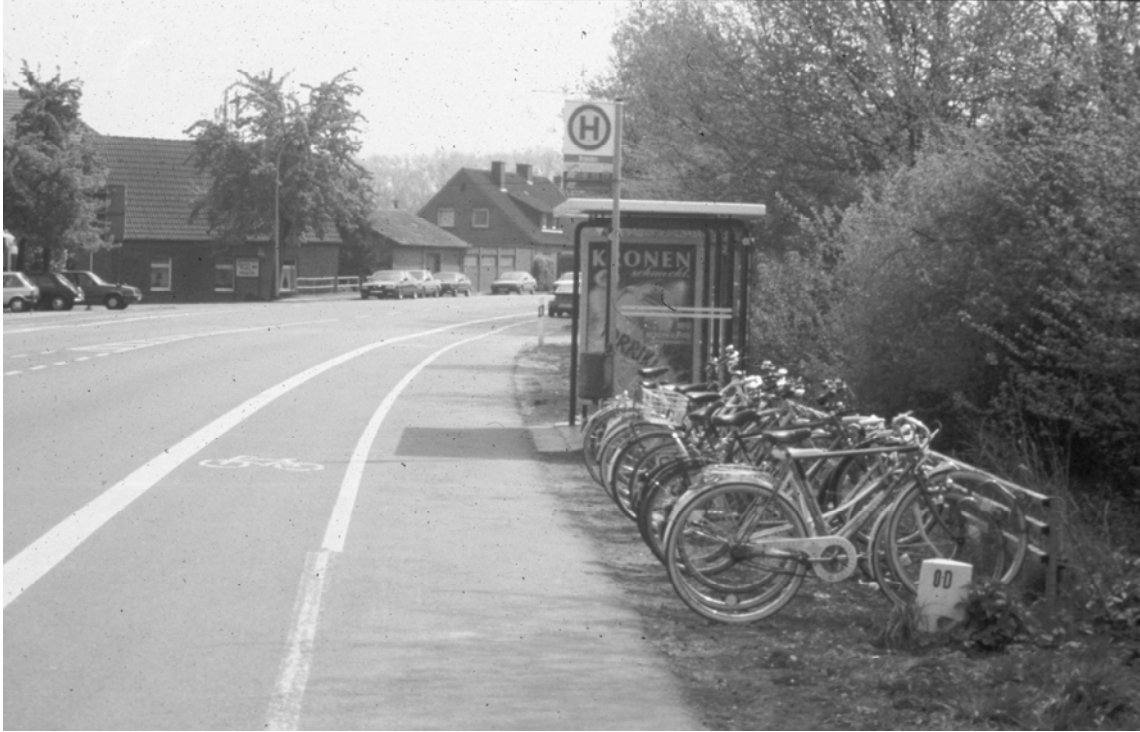
Figure ES.1: Bicycling to access buses is a common practice through the Europe.