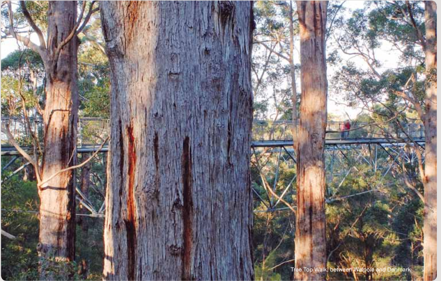
Tree Top Walk, between Walpole and Denmark.

Each year Lonely Planet chooses 10 regions they believe to be the world's most incredible to visit. And this year, they've selected Western Australia's South West. With its prestigious luxury retreats, world-class wineries, stunning natural landscapes and relaxing spa treatments the Geographe Bay and the Margaret River Wine Region lends itself perfectly to the ultimate getaway weekend and it's just two hours drive south of Perth.