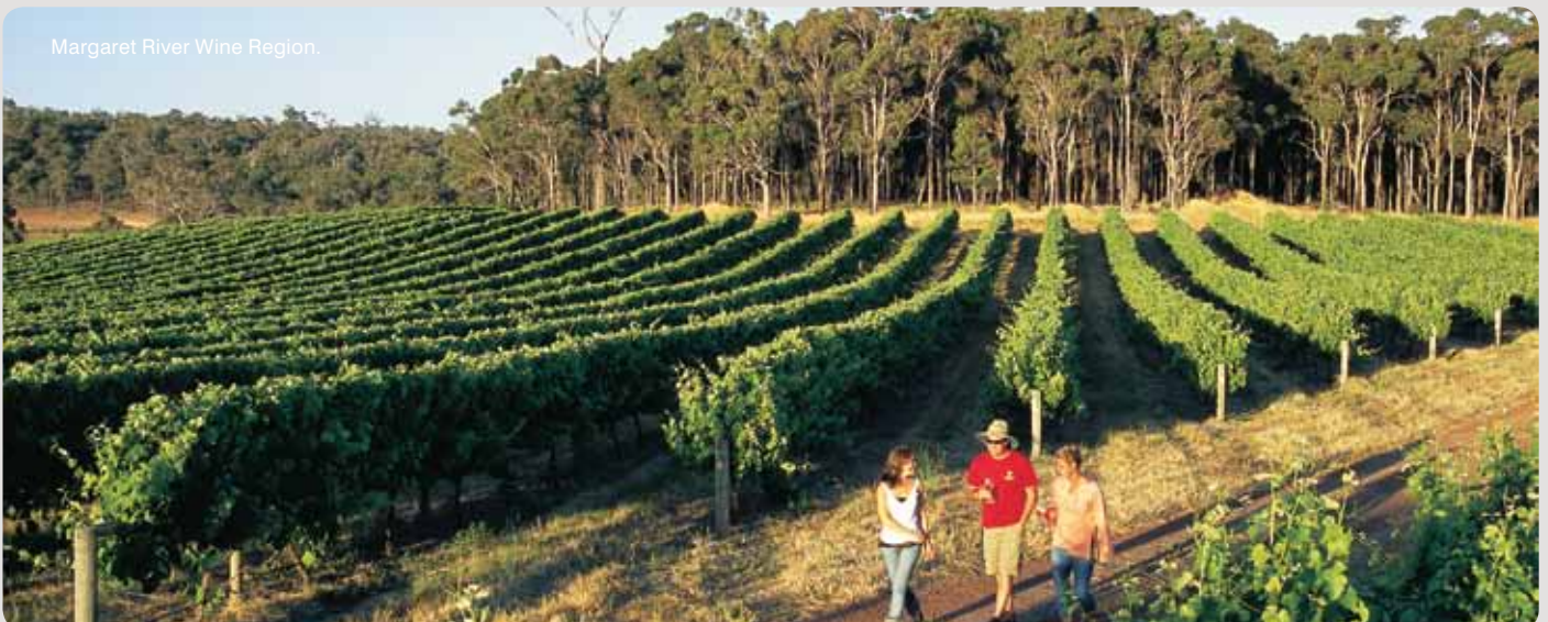
Margaret River Wine Region.