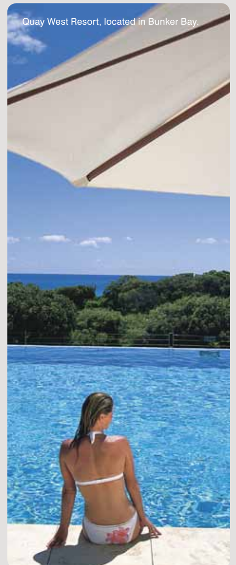
Quay West Resort, located in Bunker Bay.