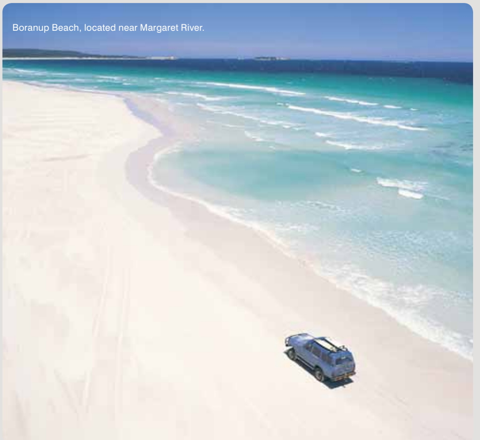
Boranup Beach, located near Margaret River.

Australia's South West region has a range of accommodation options available including quality motels, hotels, caravan and holiday parks, five star resorts, chalets, apartments, farm stays and bed and breakfasts, there are plenty of accommodation options to choose from. During peak periods and school holidays, you will need to book in advance.