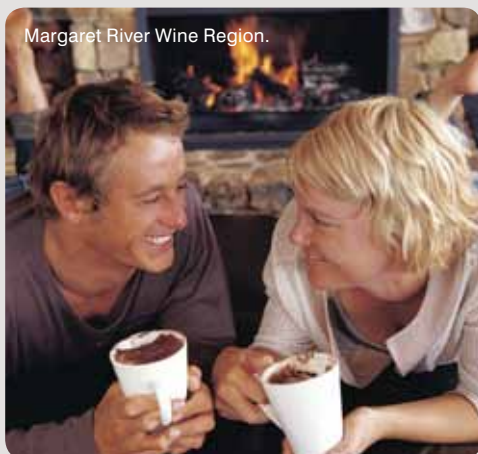
Margaret River Wine Region.