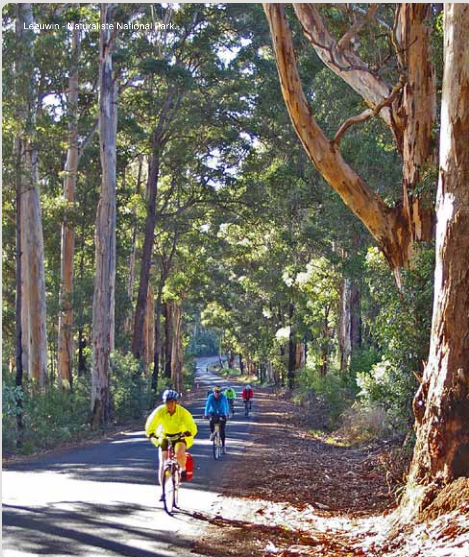
Lesauwin - Naturaliste National Park.