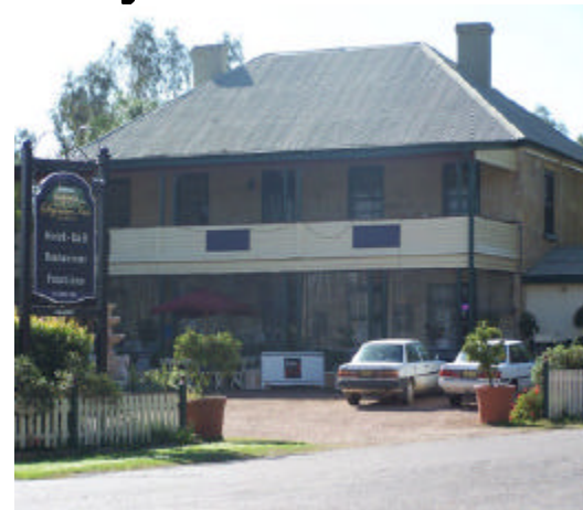
Historic Segenhoe Inn— Aberdeen

Back up the valley to the Golden Highway.