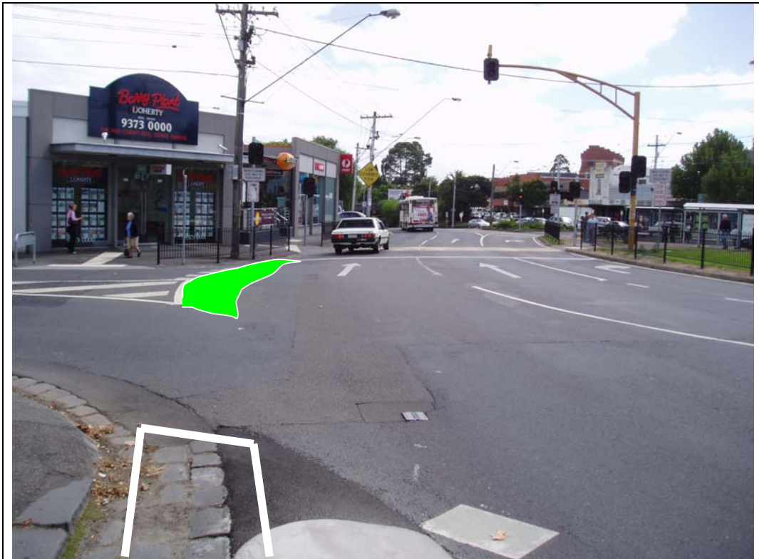
Mark green-coloured bike lane through the roundabout to pedestrian crossing. This sort of treatment is used elsewhere through St Kilda junction and Canning St bike lanes at Pigdon St roundabout.